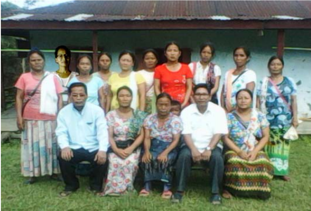
GOLDEN JUBILEE COMMITTEE