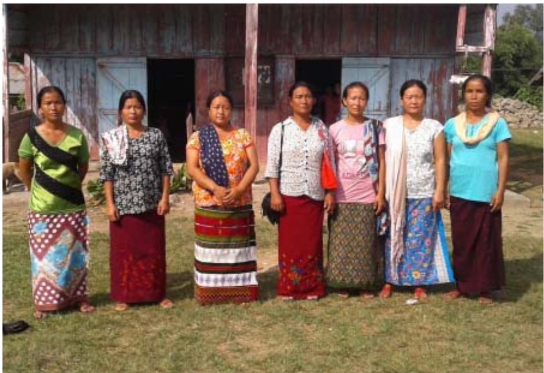
ELWA OB BEHIANG DIVISION