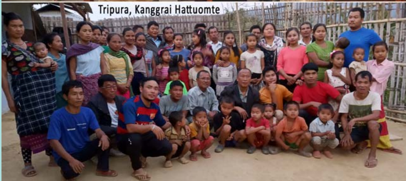
Tripura, Kangrai Hattuoemte