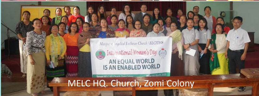
MELC HQ. Church, Zomi Colony