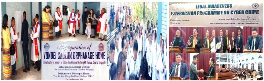
VDS New Building tha honna nei