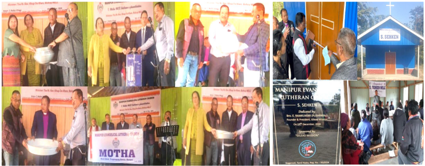
Bishop in 'MOTHA' laltuna nei