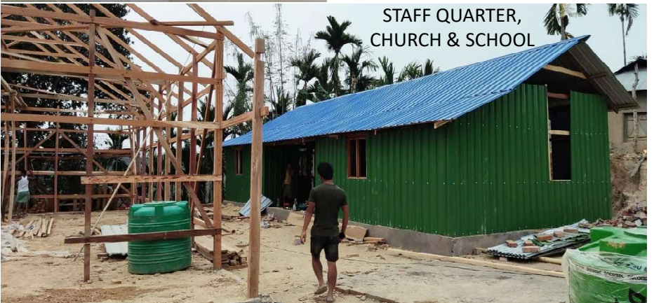
STAFF QUARTER, CHURCH & SCHOOL