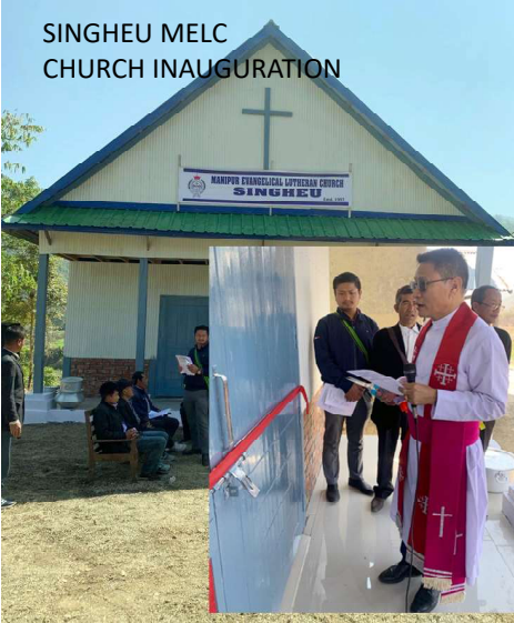
SINGHEU MELC CHURCH INAUGURATION