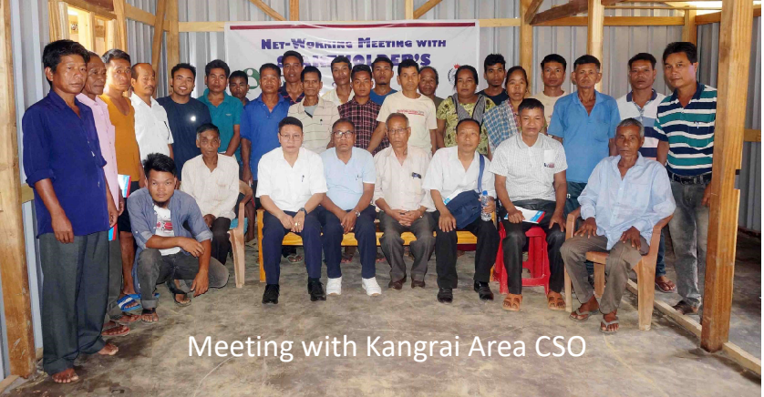
Meeting with Kangrai Area CSO