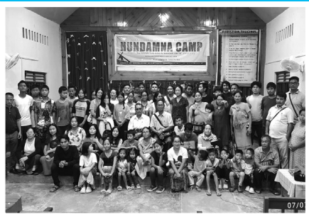
Manniang Khuo Hundamna Camp