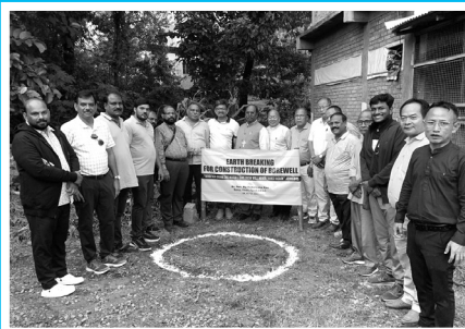
Ground Breaking MELC Water Plan