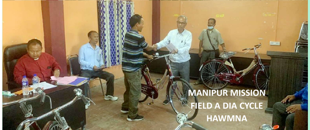
MANIPUR MISSION FIELD A DIA CYCLE HAWMNA