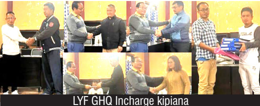
LYF GHQ Incharge kipiana