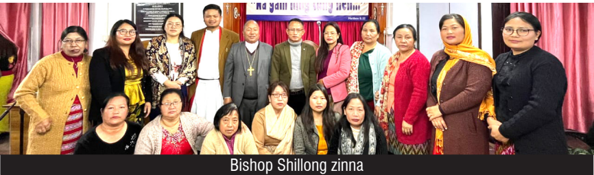
Bishop Shillong zinna