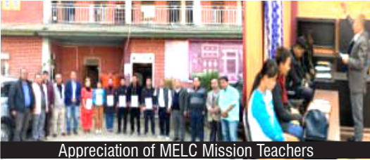
Appreciation of MELC Mission Teachers