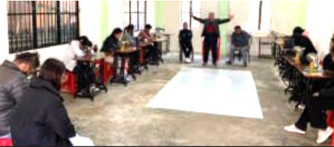
Trinity Tailoring 2nd Batch Honna